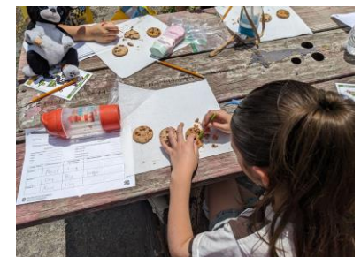
Pictured above are youth participants learning what Geologists do in their careers and pretending to mine using different cookie samples.