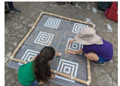
Pictured above are youth participants creating and testing harvest bots during the Ag Bot Harvest Challenge.